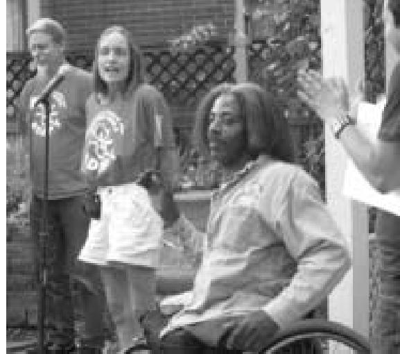
Colorado ADAPT speaking at Chinook Grantee Awards Ceremony