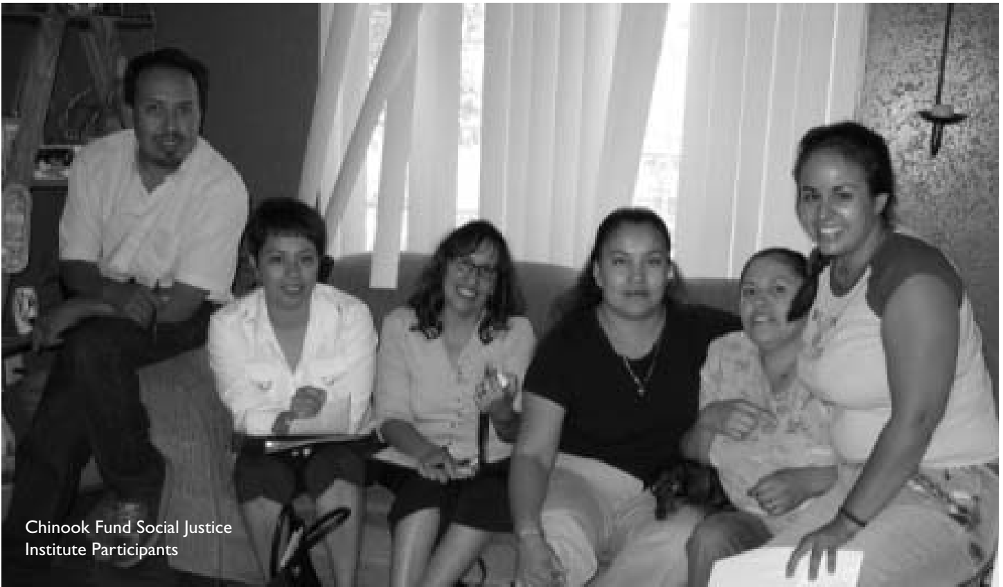
Chinook Fund Social Justice Institute Participants