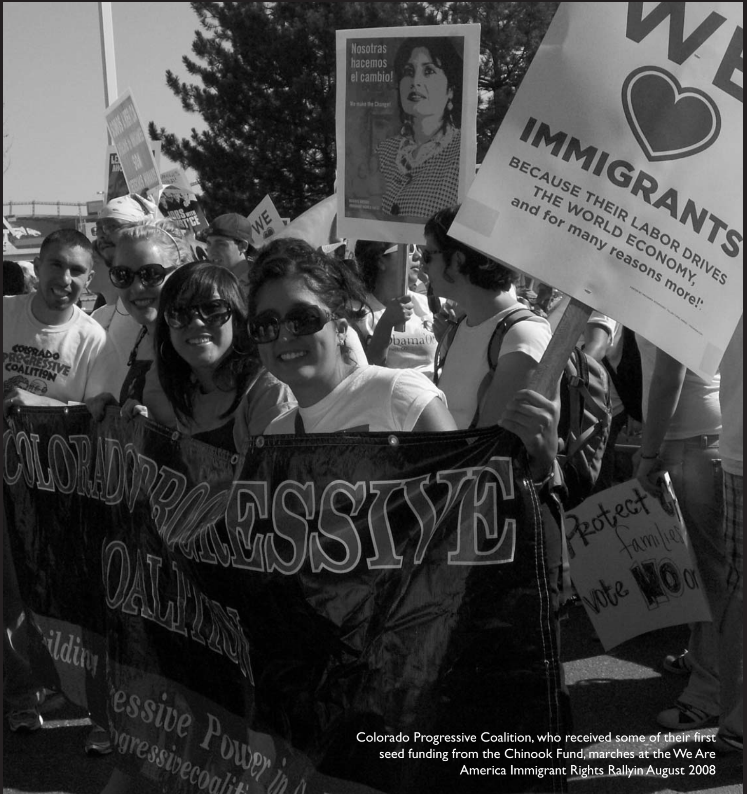
Colorado Progressive Coalition, who received some of their first seed funding from the Chinook Fund, marches at the We Are America Immigrant Rights Rally in August 2008

2418 west 32nd avenue denver, co 80211 phone (303) 455-6905 fax (303) 477-1617 website: www.chinookfund.org email: office@chinookfund.org